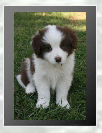
Promoting responsible pet ownership!

Thank you for giving my puppy a beautiful home. ALL puppies will be sold on a limited register, unless agreed to by myself. All puppies will be registered at birth and registration papers will be given on verification of desexing provided in the way of certificate for the named puppy form your vet.